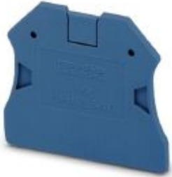
End cover, length: 47 mm, width: 2.2 mm, height: 39.8 mm, color: blue

Please be informed that the data shown in this PDF Document is generated from our Online Catalog. Please find the complete data in the user's documentation. Our General Terms of Use for Downloads are valid ( http://phoenixcontact.com/download )