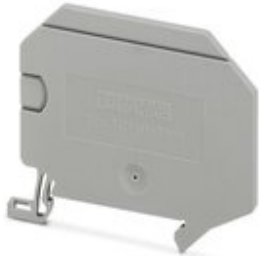
Partition plate, length: 62.1 mm, width: 2.2 mm, height: 52.5 mm, color: gray

Please be informed that the data shown in this PDF Document is generated from our Online Catalog. Please find the complete data in the user's documentation. Our General Terms of Use for Downloads are valid ( http://phoenixcontact.com/download )