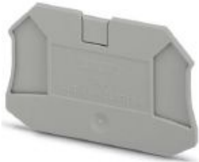
End cover, length: 64.4 mm, width: 2.2 mm, height: 39.8 mm, color: gray

Please be informed that the data shown in this PDF Document is generated from our Online Catalog. Please find the complete data in the user's documentation. Our General Terms of Use for Downloads are valid ( http://phoenixcontact.com/download )