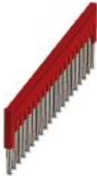
Plug-in bridge, pitch: 4.2 mm, number of positions: 20, color: red

Please be informed that the data shown in this PDF Document is generated from our Online Catalog. Please find the complete data in the user's documentation. Our General Terms of Use for Downloads are valid ( http://phoenixcontact.com/download )