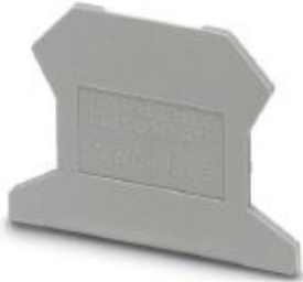
End cover, length: 42.5 mm, width: 1.5 mm, height: 30.7 mm, color: gray

Please be informed that the data shown in this PDF Document is generated from our Online Catalog. Please find the complete data in the user's documentation. Our General Terms of Use for Downloads are valid ( http://phoenixcontact.com/download )