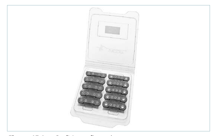
Figure 15.1 — SurfMates; five-pair sets