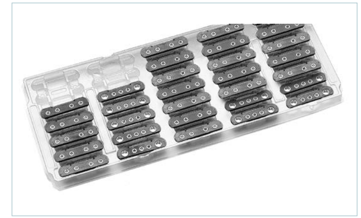
Figure 15.2 — SurfMates; individual part numbers