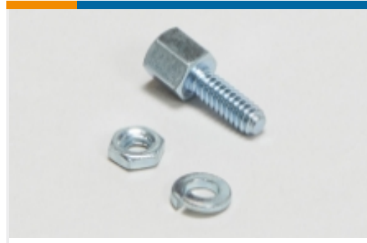
D-Sub Locking & Mounting(8)