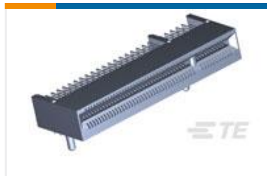
TE Part #1761465-3 PCI Express RA assy 5.8mm slot 2.3 mm pc