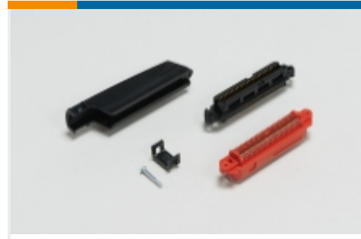
IDC D-Sub Connectors(66)