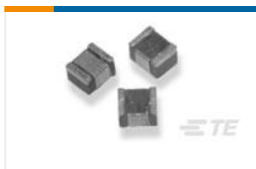
TE Part #9-1624112-4 3650 0603 0.39uH 5% 2K RL