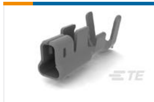
TE Part #1744423-1 EP 2.5 RCPT CONTACT, 24-20 AWG mm pc