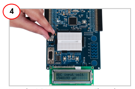
Vary the R56 potentiometer. The voltage is displayed with a 20-bit resolution on the LCD module.