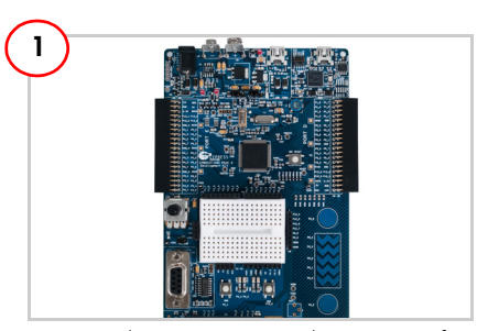
Remove the PSoC 3 Development Kit from the package.