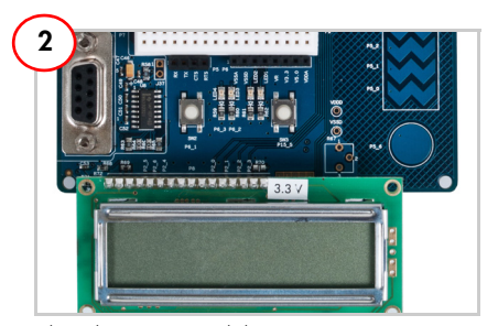
Plug the LCD module into port P8.