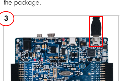
Plug the USB cable into your PC and the onboard programming USB port (11).