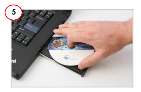
Insert the PSoC 3 Development Kit CD. Install PSoC Creator and the kit software.