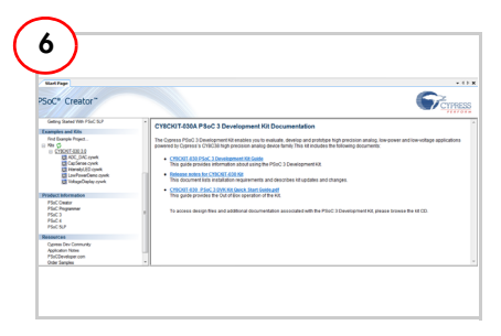
Launch PSoC Creator. Open the code examples from the Start Page.