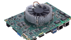
▲ Assembly View