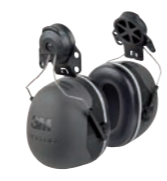
3M™ PELTOR™ Earmuffs X5 SNR: 36dB*