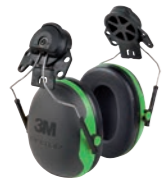
3M™ PELTOR™ Earmuffs X1 SNR: 27dB*