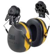
3M™ PELTOR™ Earmuffs X2 SNR: 31dB*