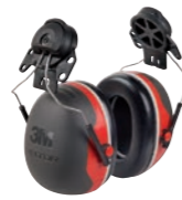
3M™ PELTOR™ Earmuffs X3 SNR: 33dB*