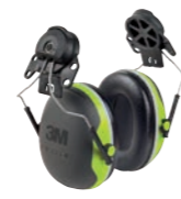
3M™ PELTOR™ Earmuffs X4 SNR: 33dB*