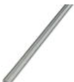
Continuous plug-in bridge, length: 500 mm, color: gray

Continuous plug-in bridge - FBST 500-PLC GY - 2966838