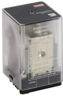
788 Clear Cover

UL listed when used with proper Magnecraft sockets