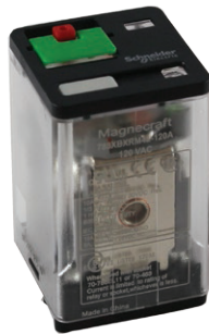
788 Full-Feature Cover