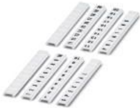
Zack marker strip flat, 10-section, vertically labeled with the consecutive numbers: 11 ... 20, white

Please be informed that the data shown in this PDF Document is generated from our Online Catalog. Please find the complete data in the user's documentation. Our General Terms of Use for Downloads are valid ( http://phoenixcontact.com/download )