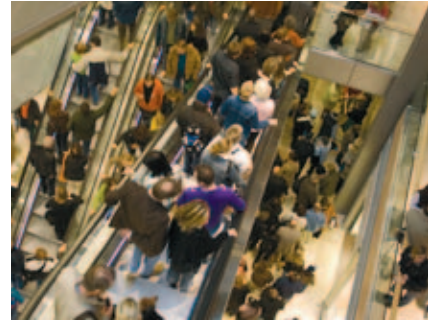
Shopping Centers, Fitness Studios