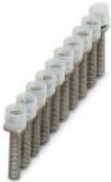
Jumper, pitch: 6 mm, number of positions: 10, color: silver

Please be informed that the data shown in this PDF Document is generated from our Online Catalog. Please find the complete data in the user's documentation. Our General Terms of Use for Downloads are valid ( http://phoenixcontact.com/download )