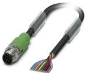
Sensor/Actuator cable, 12-position, PVC, Black RAL 9005, Plug straight M12 SPEEDCON, A-coded, on free cable end, Cable length: 5 m

Please be informed that the data shown in this PDF Document is generated from our Online Catalog. Please find the complete data in the user's documentation. Our General Terms of Use for Downloads are valid ( http://phoenixcontact.com/download )