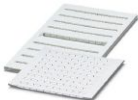
Zack marker sheet flat, 120-section, horizontally labeled with the consecutive numbers: 25 ... 36, suitable for all terminal blocks with 5.2 mm pitch, white

Please be informed that the data shown in this PDF Document is generated from our Online Catalog. Please find the complete data in the user's documentation. Our General Terms of Use for Downloads are valid ( http://phoenixcontact.com/download )