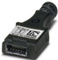
Radioline - configuration stick for easy and safe network addressing for the 900 MHz wireless module (RAD-900-...), unique network ID, RF band 1

Please be informed that the data shown in this PDF Document is generated from our Online Catalog. Please find the complete data in the user's documentation. Our General Terms of Use for Downloads are valid ( http://phoenixcontact.com/download )