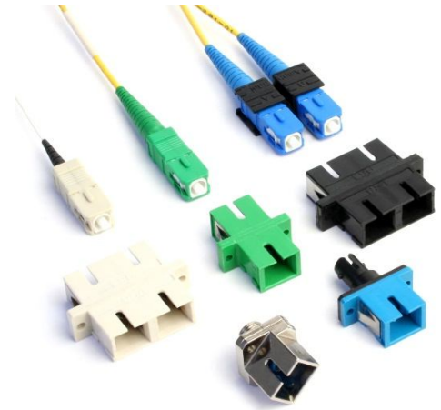
Multiple Options on SC Adapters