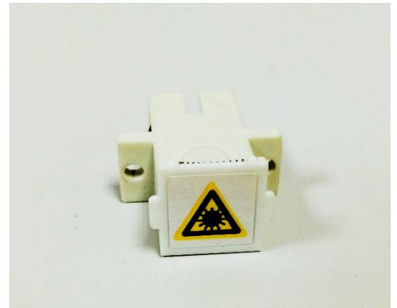
SC External Shuttered Adapters