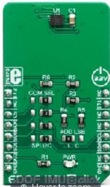
6DOF IMU 8 click Hover to zoom