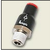
7995 NON-RETURN VALVE, EXHAUST VERSION, BSP TAPER