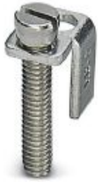
Chain bridge, pitch: 6 mm, number of positions: 1, color: silver

Please be informed that the data shown in this PDF Document is generated from our Online Catalog. Please find the complete data in the user's documentation. Our General Terms of Use for Downloads are valid ( http://phoenixcontact.com/download )