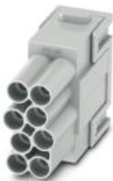
Contact insert module, number of positions: 8, power contacts: 8, control contacts: 0, Socket, Push-in connection, 400 V, 16 A, 0.5 mm 2 ... 2.5 mm 2 , application: Power

Please be informed that the data shown in this PDF Document is generated from our Online Catalog. Please find the complete data in the user's documentation. Our General Terms of Use for Downloads are valid ( http://phoenixcontact.com/download )