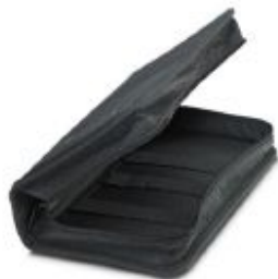
Tool box, unequipped

Please be informed that the data shown in this PDF Document is generated from our Online Catalog. Please find the complete data in the user's documentation. Our General Terms of Use for Downloads are valid ( http://phoenixcontact.com/download )