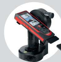
Leica FTA360-S adapter Art.No. 828 414