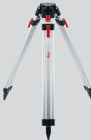
Leica TRI 200 tripod with 1/4" thread Art.No. 828 426