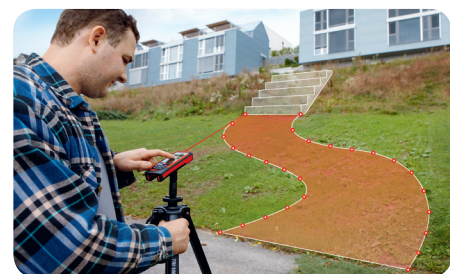
Measuring points and areas