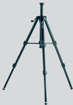
Leica TRI 70 tripod Art.No. 794 963