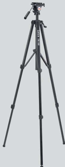
Leica TRI 100 tripod Art.No. 757 938