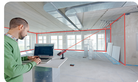
Real-time transfer of point coordinates