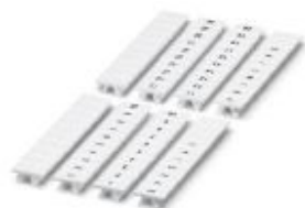
Zack marker strip, 10-section, horizontally labeled with the consecutive numbers: 31 ... 40, white, width: 5 mm

Please be informed that the data shown in this PDF Document is generated from our Online Catalog. Please find the complete data in the user's documentation. Our General Terms of Use for Downloads are valid ( http://phoenixcontact.com/download )