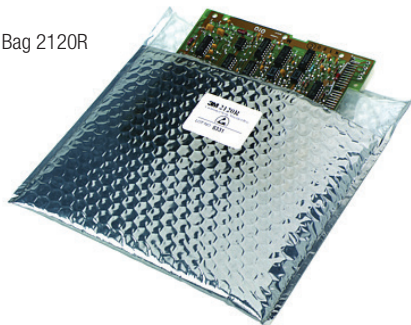
3M™ Cushioned Shielding Bag 2120R

The Cushion Shielding Bag 2120R protects devices from physical damage as well as provides static shielding. They also offer a heat sealable inner surface.