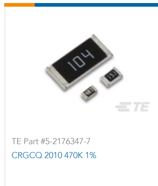
TE Part #5-2176347-7 CRGCQ 2010 470K 1%