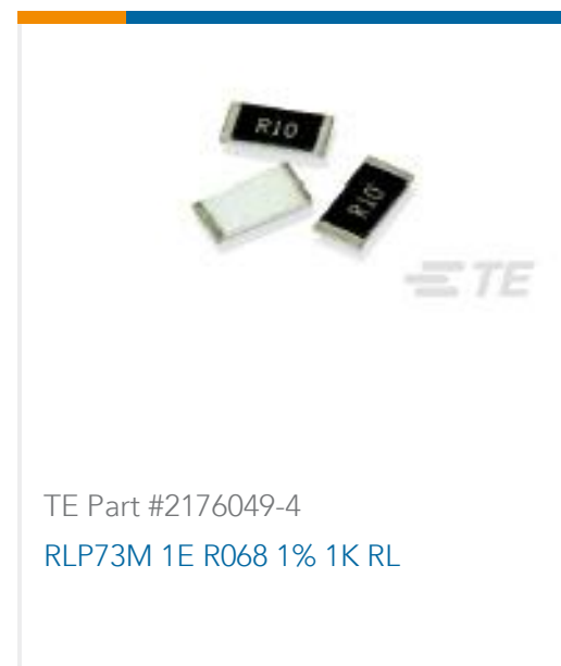
TE Part #2176049-4 RLP73M 1E R068 1% 1K RL