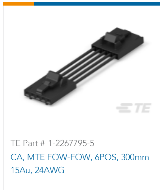
TE Part # 1-2267795-5 CA, MTE FOW-FOW, 6POS, 300mm 15Au, 24AWG