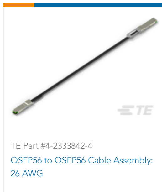
TE Part #4-2333842-4 QSFP56 to QSFP56 Cable Assembly: 26 AWG