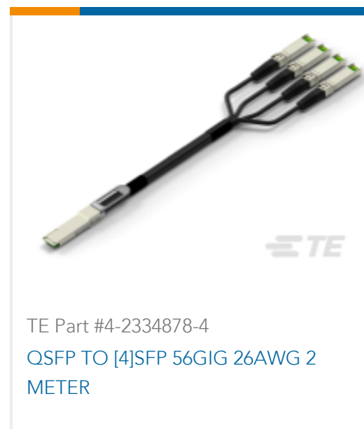
TE Part #4-2334878-4 QSFP TO [4]SFP 56GIG 26AWG 2 METER