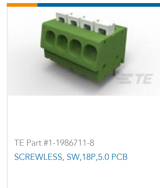
TE Part #1-1986711-8 SCREWLESS, SW,18P,5.0 PCB