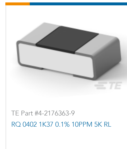
TE Part #4-2176363-9 RQ 0402 1K37 0.1% 10PPM 5K RL