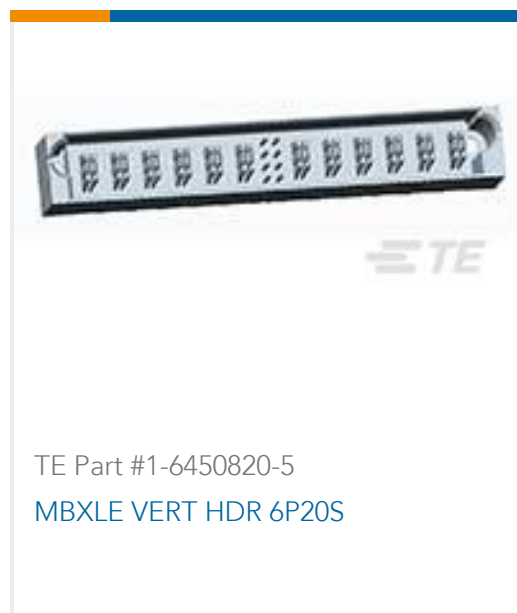
TE Part #1-6450820-5 MBXLE VERT HDR 6P20S