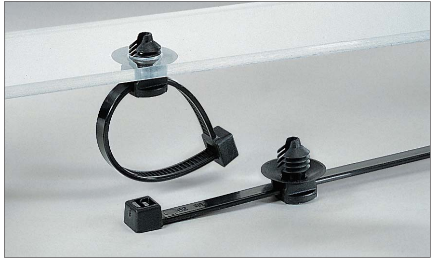
These Fir Tree fixings can also be used in threaded, blind holes.

Primarily designed for fixing cable harnesses in the automotive industry, their simplicity and ease of use, has resulted in these parts being used in many industries, for example: aviation, switch gear manufacture and white goods.