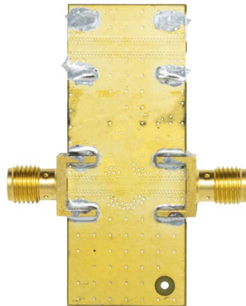
Figure 2. ADL8104-EVALZ Secondary Side