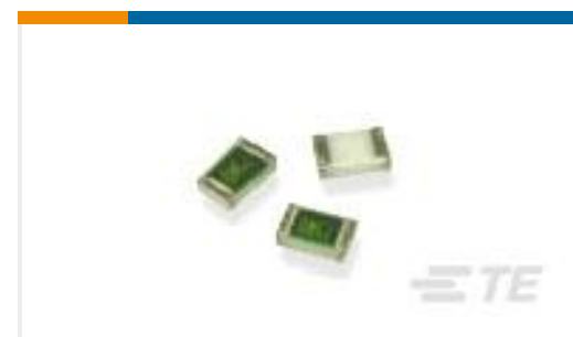
TE Part #4-1879134-6 RN 0603 29K4 0.1% 10PPM 1K RL