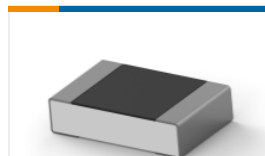
TE Part #7-2176374-6 RQ 0805 649R 0.1% 10PPM 1K RL