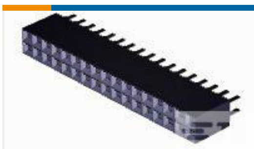
TE Part #6-534206-7 34 MODII VRT DR CE 100/115