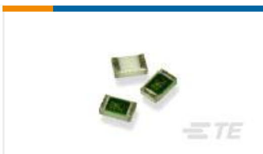
TE Part #7-1879213-6 CPF 0402 178R 0.1% 25PPM 1K RL