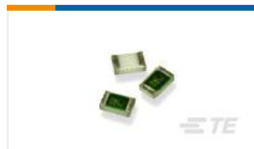
TE Part #6-1879214-6 CPF 0402 1K74 0.1% 25PPM 1K RL