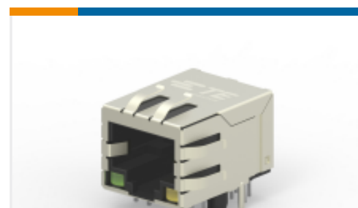
TE Part #6-2301994-0 RJ45 JACK INT.MAG. 1GB LED 1X1