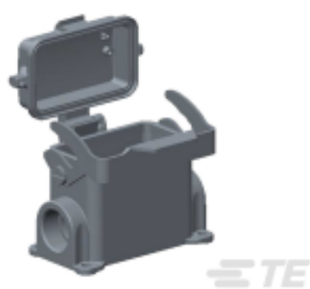
TE Model / Part # T1620103116-000 H10B-SDR-LB-PG16