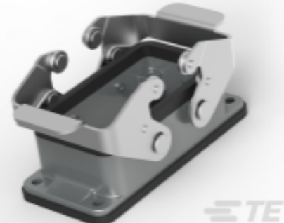
TE Model / Part # T1410101000-000 H10B-AGS