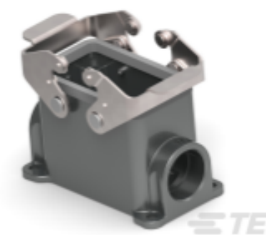
TE Model / Part # T1440101120-000 H10B-SGRS-M20