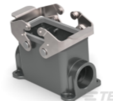
TE Model / Part # T1440101220-000 H10B-SGRS-2M20