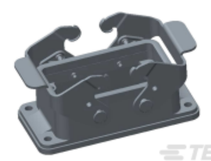
TE Model / Part # T1410102000-100 H10B-AG