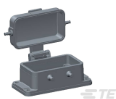
TE Model / Part # T1430101000-000 H10B-ADM-BO