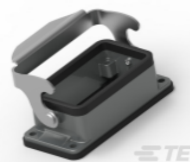
TE Model / Part # T1500102000-000 H10B-AGS-LB