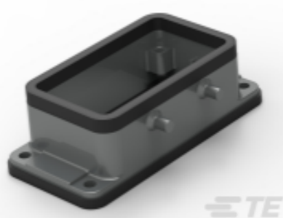
TE Model / Part # T1420100000-000 H10B-AG-BO