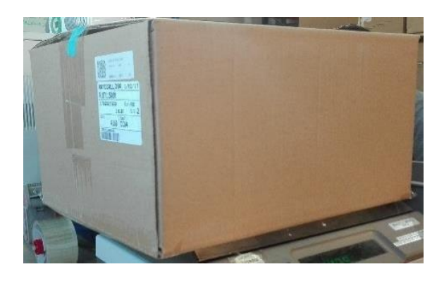
Carboard box Dimensions (WxLxH): 40 x 30 x 20 cm Weight: ≈ 8.5kg

Number of housings/ Plastic bag: 2400 / box: 4800 pcs