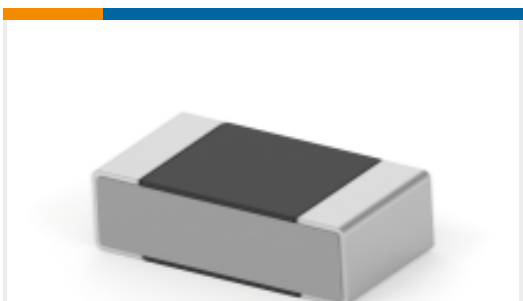
TE Part #8-1879140-4 RN 0603 137K 0.1% 10PPM 5K RL