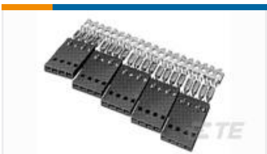
TE Part #5-104439-5 4X6 MTE RCPT SR PLAIN .100CL