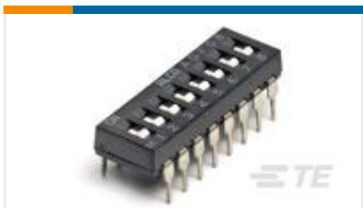
TE Part #4-1825059-2 ADF08STTR04=DIP S,FLUSH,SMT-GW