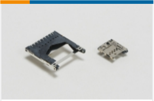
SD Card Connectors(1)