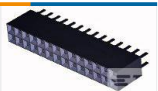
TE Part #1-534998-4 28 MODIV VRT DR CE 100/125