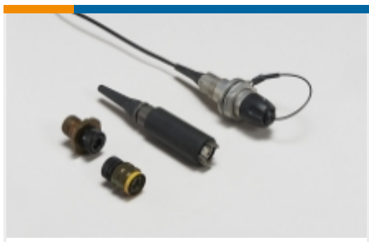
Expanded Beam Fiber Optics(9)