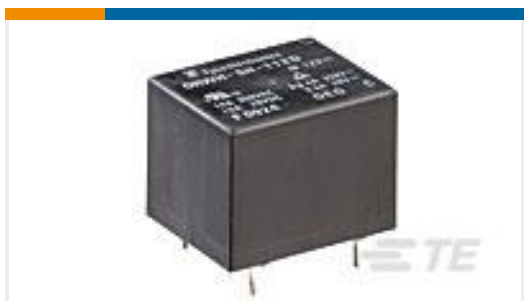
TE Part #1-1721150-5 ORWH-SH-124D1F,000