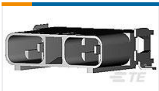
TE Part #2106056-8 Assembly, Right Angle SMT Header, 4-Posi