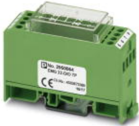
Diode module, for extension with 7 1N 4007 diodes, common cathode

Please be informed that the data shown in this PDF Document is generated from our Online Catalog. Please find the complete data in the user's documentation. Our General Terms of Use for Downloads are valid ( http://phoenixcontact.com/download )