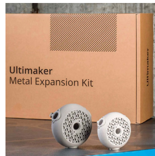
Metal Expansion Kit Simple and affordable metal printing with an all-in-one kit