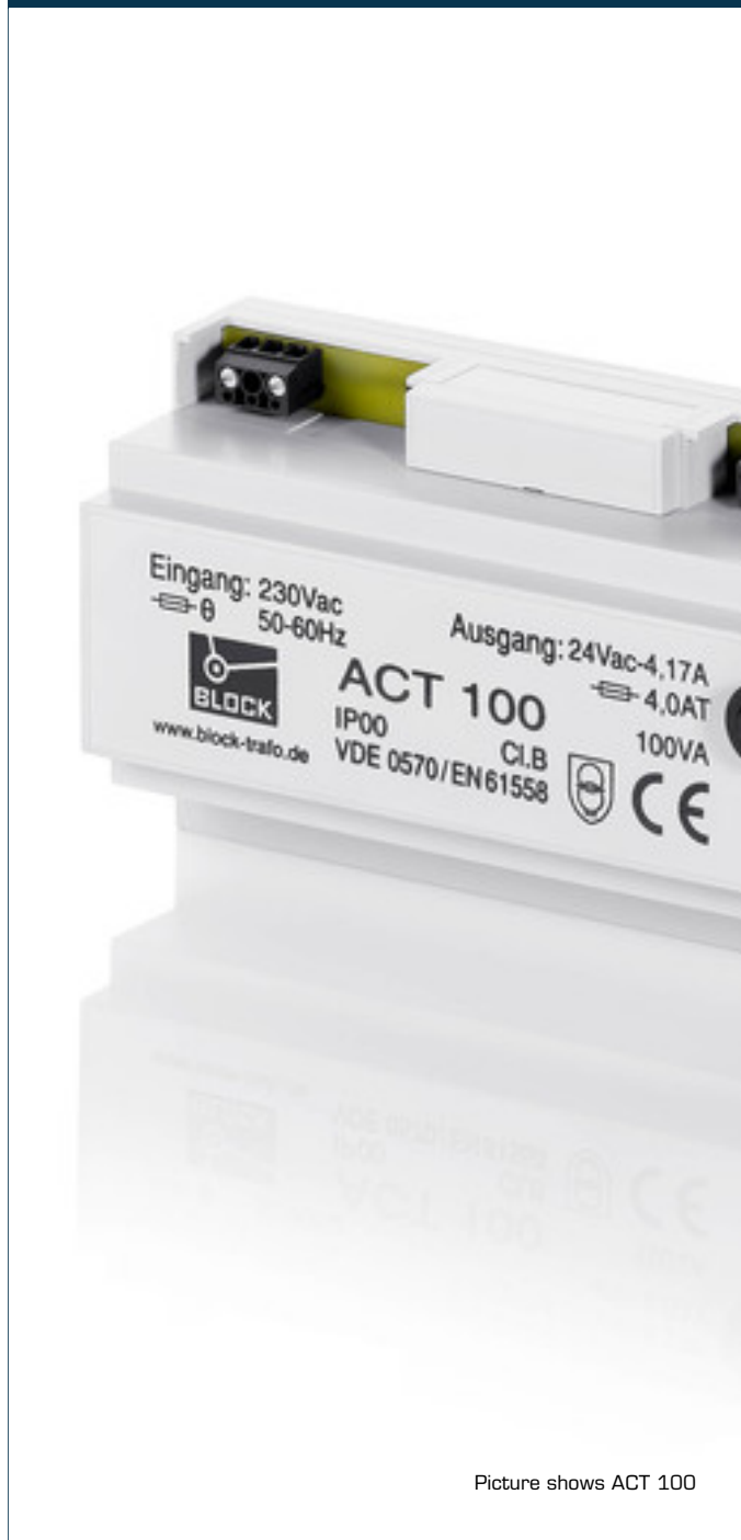
Picture shows ACT 100