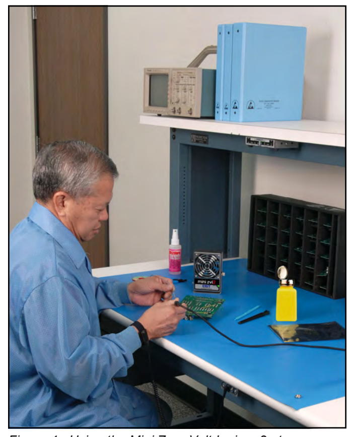
Figure 4. Using the Mini Zero Volt Ionizer 2 at a workstation.

Connect the power adapter to the ionizer to turn it on. When the unit is first turned on, it conducts a self-test. The audible alarm will sound, and the status LED will cycle through orange and green. The LED will remain green during normal operation.