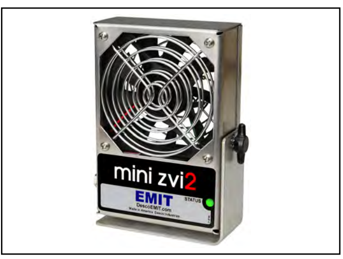
Figure 1. EMIT 50642 Mini Zero Volt Ionizer 2