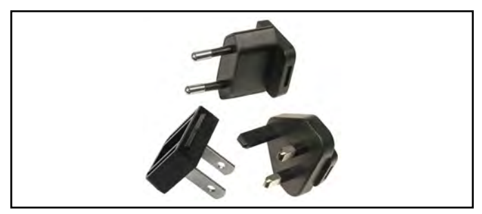
Figure 2. Interchangeable power adapter plugs included with the Mini Zero Volt Ionizer 2