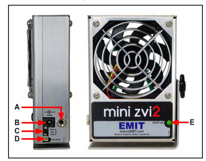
Figure 3. Mini Zero Volt Ionizer 2 features and components