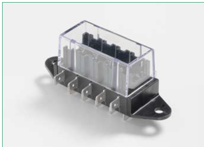
Dimensions in mm / Maße in mm