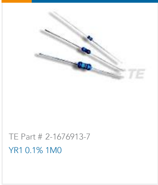
TE Part # 2-1676913-7 YR1 0.1% 1M0