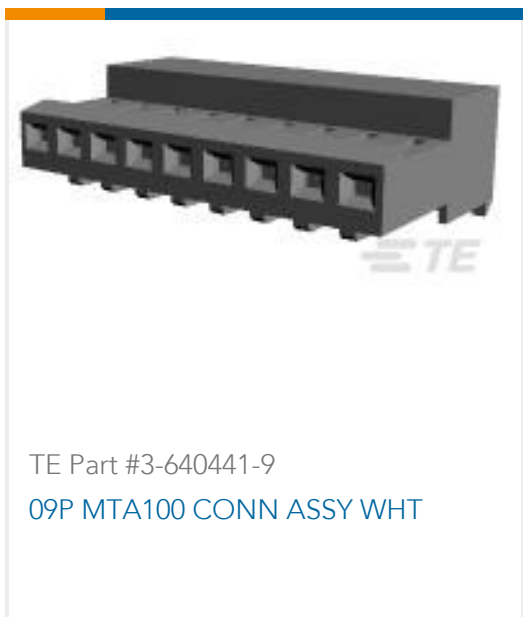
TE Part #3-640441-9 09P MTA100 CONN ASSY WHT