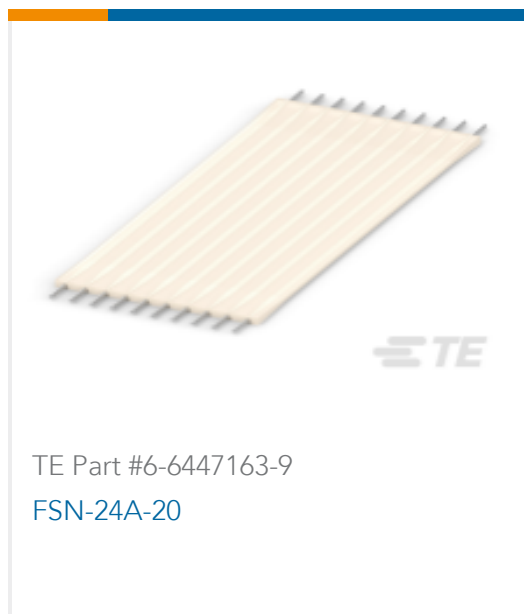
TE Part #6-6447163-9 FSN-24A-20