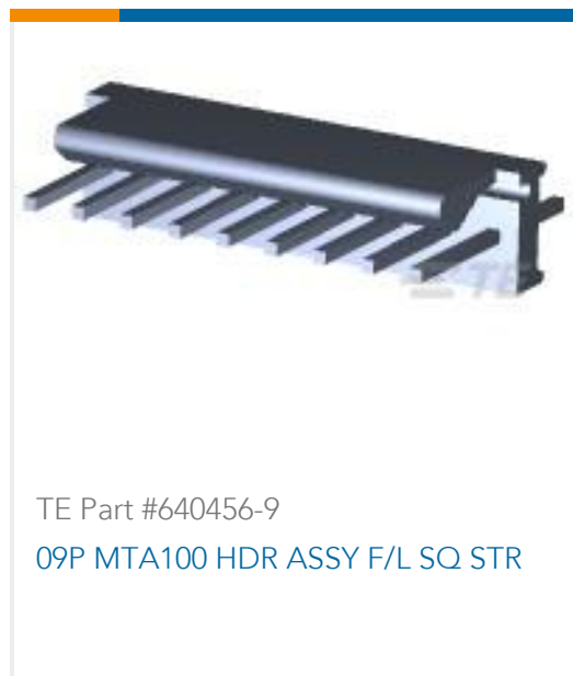
TE Part #640456-9 09P MTA100 HDR ASSY F/L SQ STR