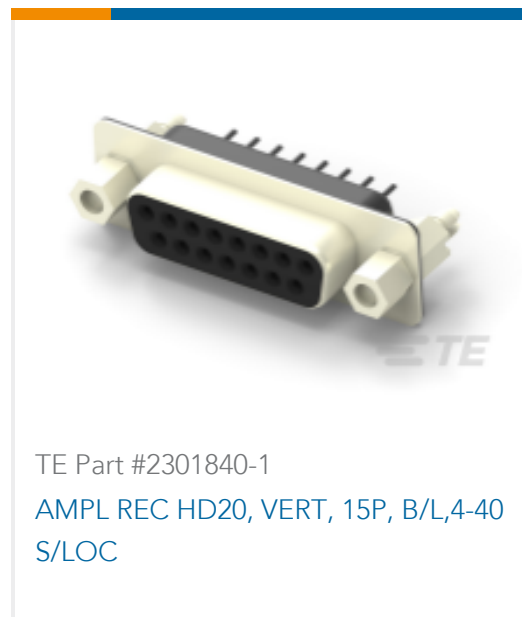
TE Part #2301840-1 AMPL REC HD20, VERT, 15P, B/L,4-40 S/LOC