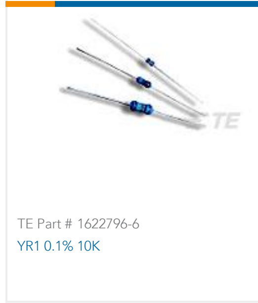
TE Part # 1622796-6 YR1 0.1% 10K