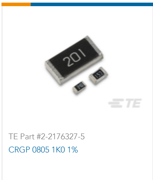
TE Part #2-2176327-5 CRGP 0805 1K0 1%