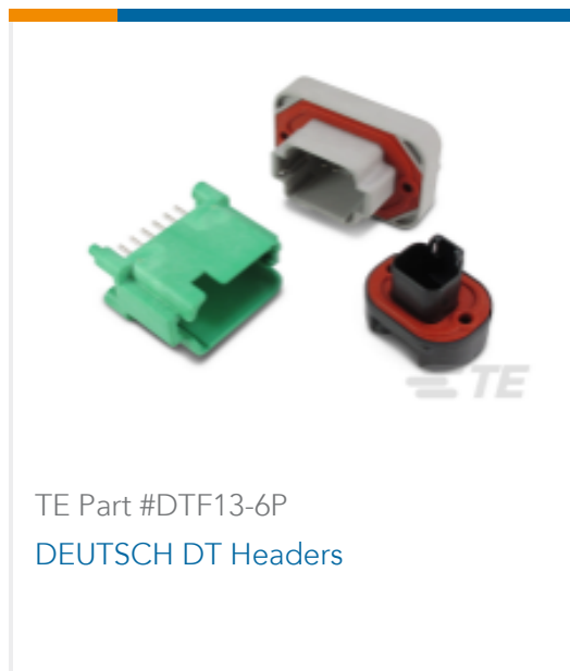
TE Part #DTF13-6P DEUTSCH DT Headers