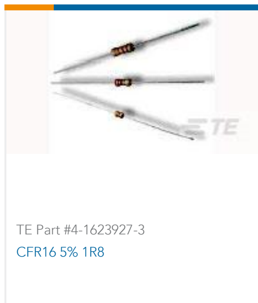
TE Part #4-1623927-3 CFR16 5% 1R8