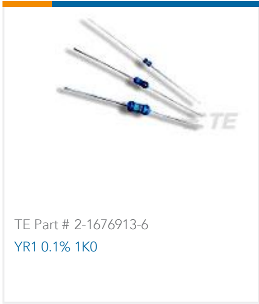
TE Part # 2-1676913-6 YR1 0.1% 1K0