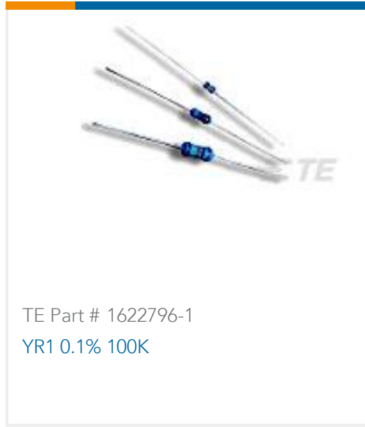
TE Part # 1622796-1 YR1 0.1% 100K