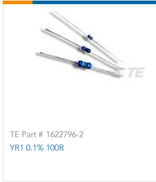
TE Part # 1622796-2 YR1 0.1% 100R