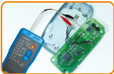
test positive and negative pole of DC electric level

Push DIP switch on emitter to position of “SCAN” , press function switchover button on emitter for 2 seconds, “STATUS” indicator will turn off and “VERIFY” indicator flashes, insert the crystal plug of crocodile clamp into RJ11, clamp the two ends of cable with crocodile clamps, in case that “STATUS” indicator lights up in red , it means the end clamped by red clamp is positive pole, in case that “STATUS” indicator lights up in green, it means the end clamped by red clamp is negative pole, electric level can be judged by brightness of the status indicators; the lighter the indicator, the higher the level is; the darker, the lower.