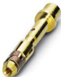
Crimp contact, turned, Single contact, contact diameter: 1 mm, crimp range: 0.14 mm 2 ... 0.5 mm 2

Please be informed that the data shown in this PDF Document is generated from our Online Catalog. Please find the complete data in the user's documentation. Our General Terms of Use for Downloads are valid ( http://phoenixcontact.com/download )