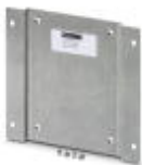
Mounting plate for SFNT switches

Mounting plate - FL PA SFNT 5-8 - 2891012