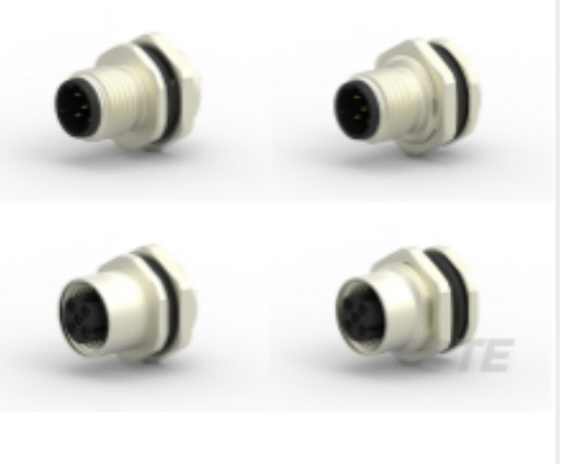
TE Part # CAT-C73765-M1G M12 Panel Mount Solder Cups