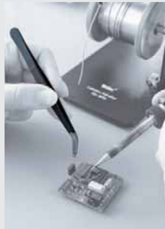
Tweezers are important tools for any electronics technician to enable the necessary work to be carried out safely in the often small, confined structures of PCBs.