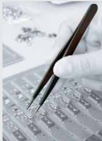
Thanks to its wide selection of tips, the Professional ESD precision tweezers handle even tricky work effortlessly, for example on sensitive semiconductors.

Unlike purely metal tweezers, the special coating here ensures a controlled dissipation of static charges, and therefore safe, standard-compliant use.