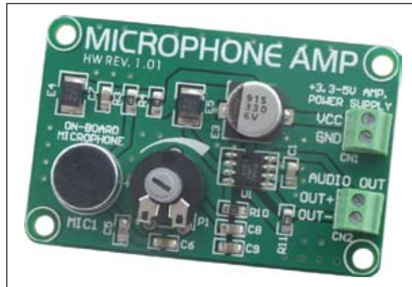
Figure 1: MICROPHONE AMP additional board