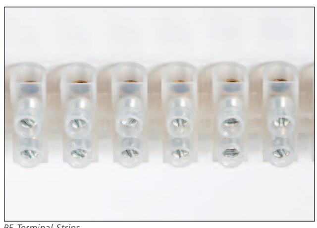
PE Terminal Strips.