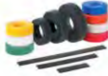
HLS (Strip Ties)