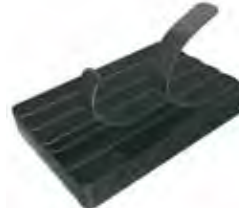
HLB (Stacked Strips)