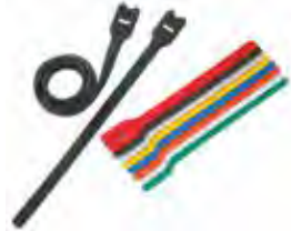
HLT (Loop Ties)