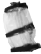
Puller Protection Blankets TMMX series