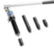
Force Generators Advanced Hydraulic Spindle TMHS series