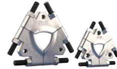
Tri-section Pulling Plates TMMS series