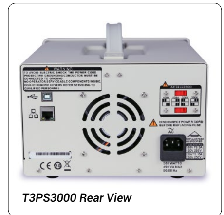
T3PS3000 Rear View